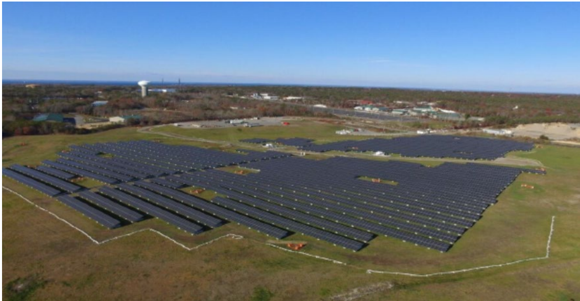
Falmouth Landfill Solar Array

On April 29, 2016 the Falmouth EDIC entered into a 20-year sub-lease agreement with Falmouth Landfill Solar LLC / Citizen's Energy Corp. to develop and operate a ground mounted solar array energy generation facility on an 18.8-acre portion of land at the Falmouth Dept. of Public Works Waste Management property located at 0 Blacksmith Shop Road in Falmouth, MA – a capped municipal landfill. This project was developed in 2 phases.