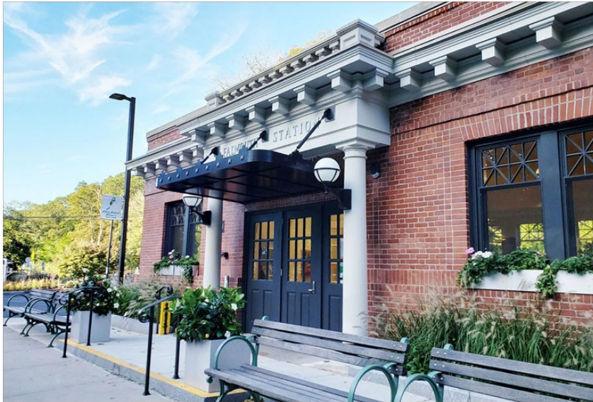
The Falmouth Station

In 2015, the Falmouth EDIC entered a long-term ground lease with Mass DOT to acquire and renovate the historic Falmouth Station. In conjunction with the lease, Mass DOT provided the Falmouth EDIC with a $1.4 million grant to renovate the Station. With the help of the Falmouth EDIC, local representatives, local business leaders and Mass DOT, this main portion of the renovation project was completed beautifully in the Spring of 2017.